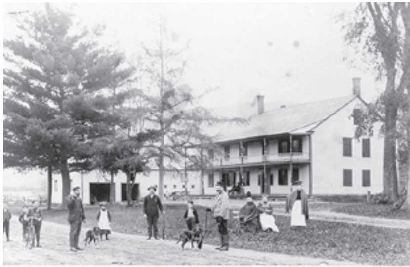
The Surry Village Hotel was operated by the Robinsons from 1793 to 1845. Pictured are village school children, staff of the hotel, and visiting huntsmen with their hounds.