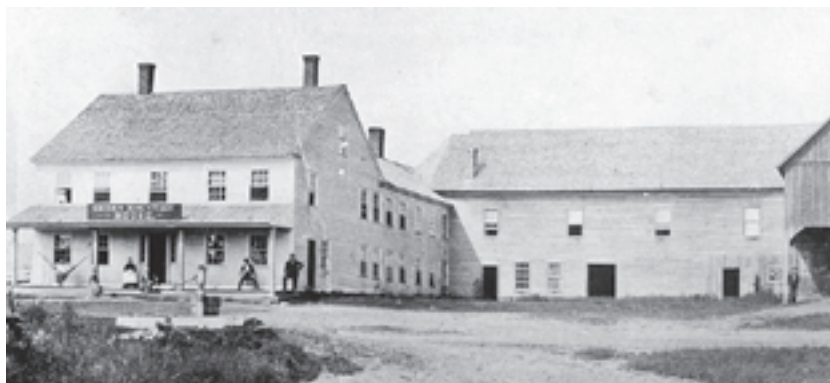
This picture of Green Mountain Home (also known as Box Tavern) in Stoddard was taken in 1888.