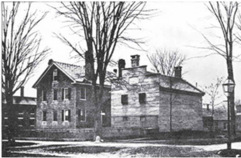
Keene jail was constructed in 1833 of granite quarried in Roxbury. It was located on near where Mechanic Street is located today and served as the county jail until 1884, when the new jail was built on Washington Street.