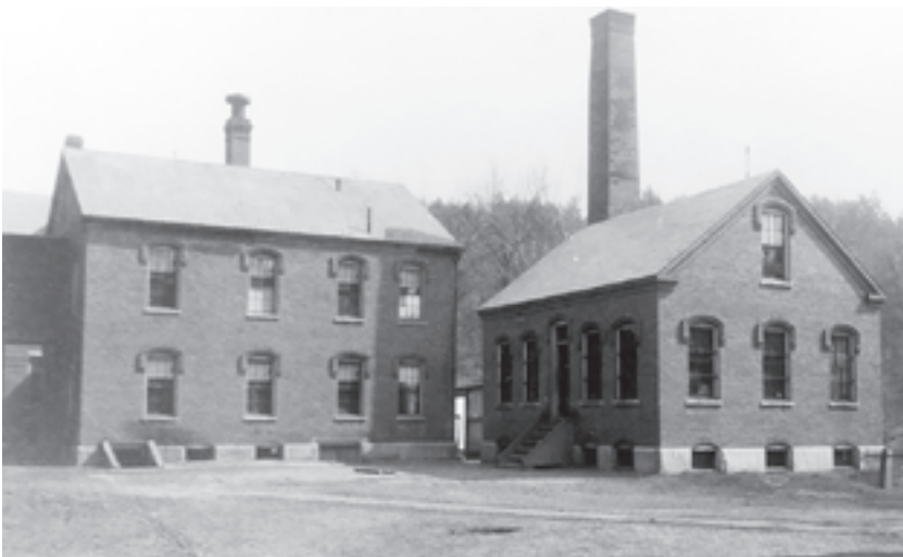
The Staff Quarters and the jail at the County Farm in Westmoreland.