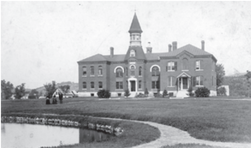
A mounted photograph of the Cheshire County Jail at Fuller Park on Washington Street. The building is now the Keene Recreation Center.