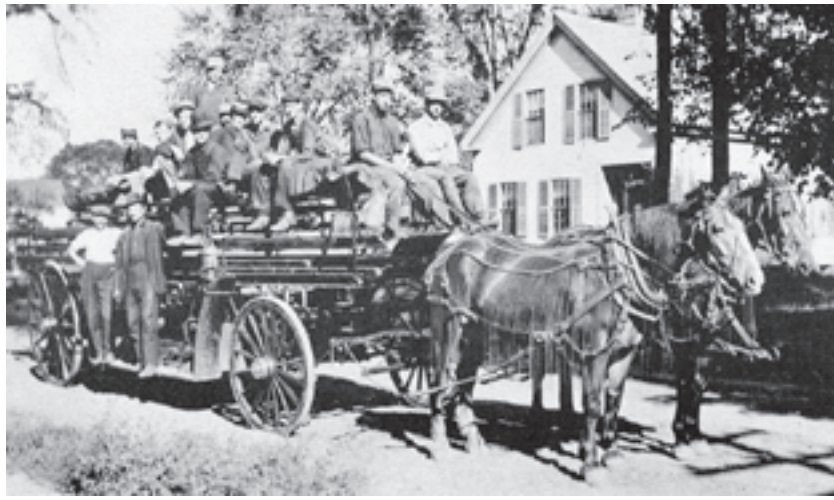
A photograph of men in a fire wagon returning from a call, sometime in the late 1800s.