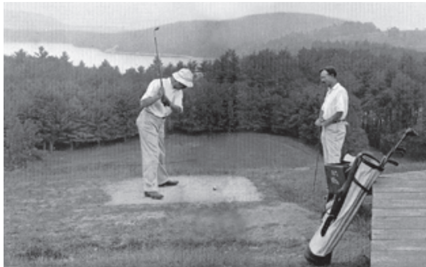
Teeing off toward Spofford Lake.