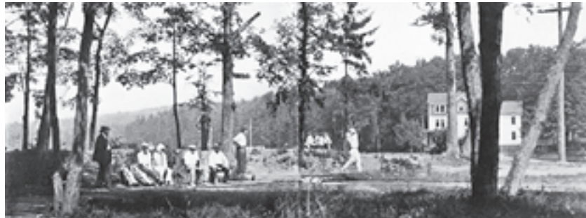
Lakeside golfing at the original first tee box.