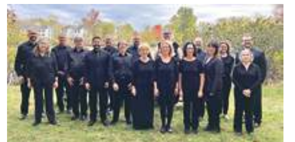
The Chamber Singers of Keene will perform at St. James Episcopal Church in Keene.

Tickets are $20 at the door or are available from members in advance.