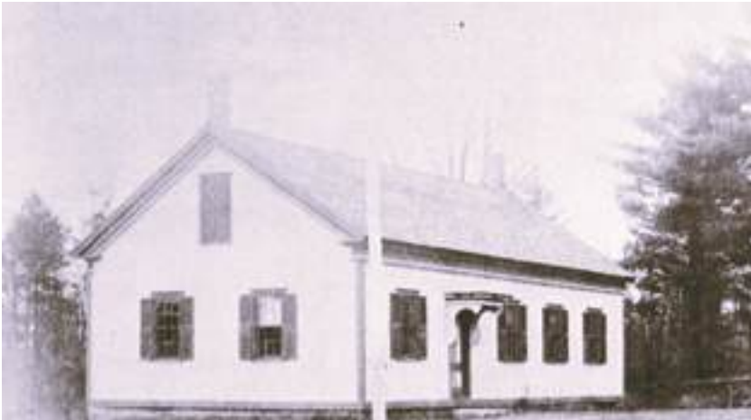
In what Cheshire County village was this schoolhouse located?

(Prepared by the Historical Society of Cheshire County)