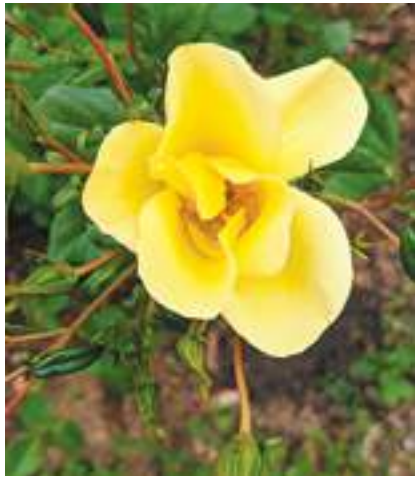
Limoncello Shrub Rose

Roses are the national flower of England and, somewhat surprisingly, also the national flower of the US. I do wonder why President Ronald Reagan didn't pick a flower native to these lands, such as sunflowers or coneflowers. Apparently, other contenders were the marigold, columbines, and goldenrod. Whatever the reasons, I can't deny that roses really do captivate the heart and mind with their brilliant scent and magical layers of soft petals. When it comes to successfully growing them, however, I must say that it has been a bit of a learning curve for me. Garden nurseries say that you can dig a hole, put the rose bush in, cover with soil and water, and walk away. Well, I can guarantee you that I've tried that and success was rather minimal. Here are a few things I've learned over the years that I hope will help you to raise flourishing roses.